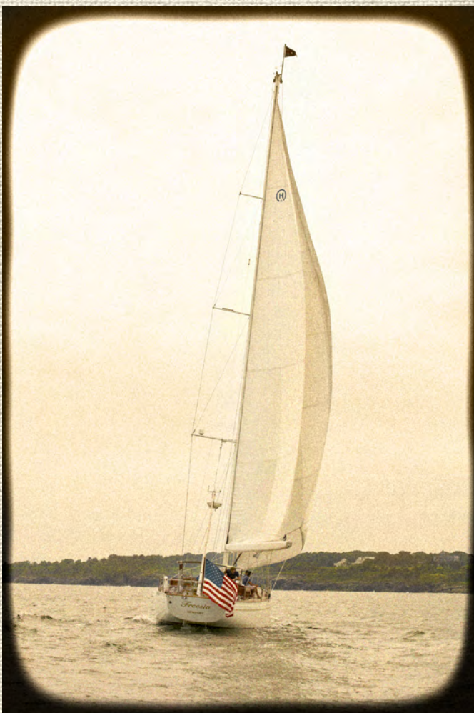
OCTOBER 2013 | 171